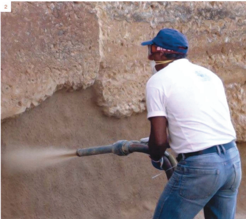
2 | Sprayed earth: an innovative technique allowing for effective, durable and unexpensive rehabilitation of traditional raw earth constructions

Implementing the GQS makes it possible to assure the quality of the heritage conservation and traditional building rehabilitation interventions, to promote a specialist sector of relevance to the economy, to stimulate the qualification of its human resources and contribute towards preserving practices and know-how which themselves are a major asset and heritage. Finally, but of no less importance, the system can contribute decisively towards the major investments in building rehabilitation and heritage conservation which are being lined up for the next few years and decades being translated into effective and long-lasting interventions ■